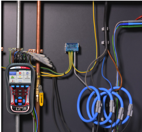
Power Quality Simulator Package Set