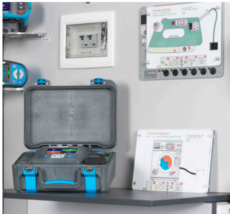
Appliances/ Machines/ Switchboard Package Set