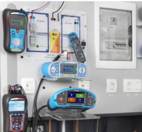
Photovoltaic Package Set