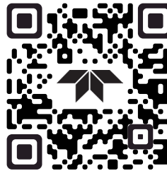
Apple Store FLIR Apps