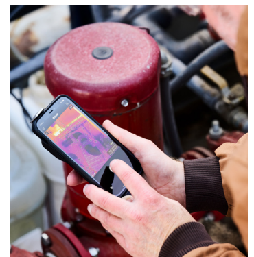
Mobile phone not included